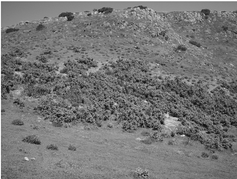
Figure 3. Cholla patch on south-facing slopes below Mesa Jesus Maria, 9 March 2005. A pair of Cactus Wrens was observed nesting in this patch.

Image Source: Copyright Globe Xplorer, All Rights Reserved (flown April 2007)