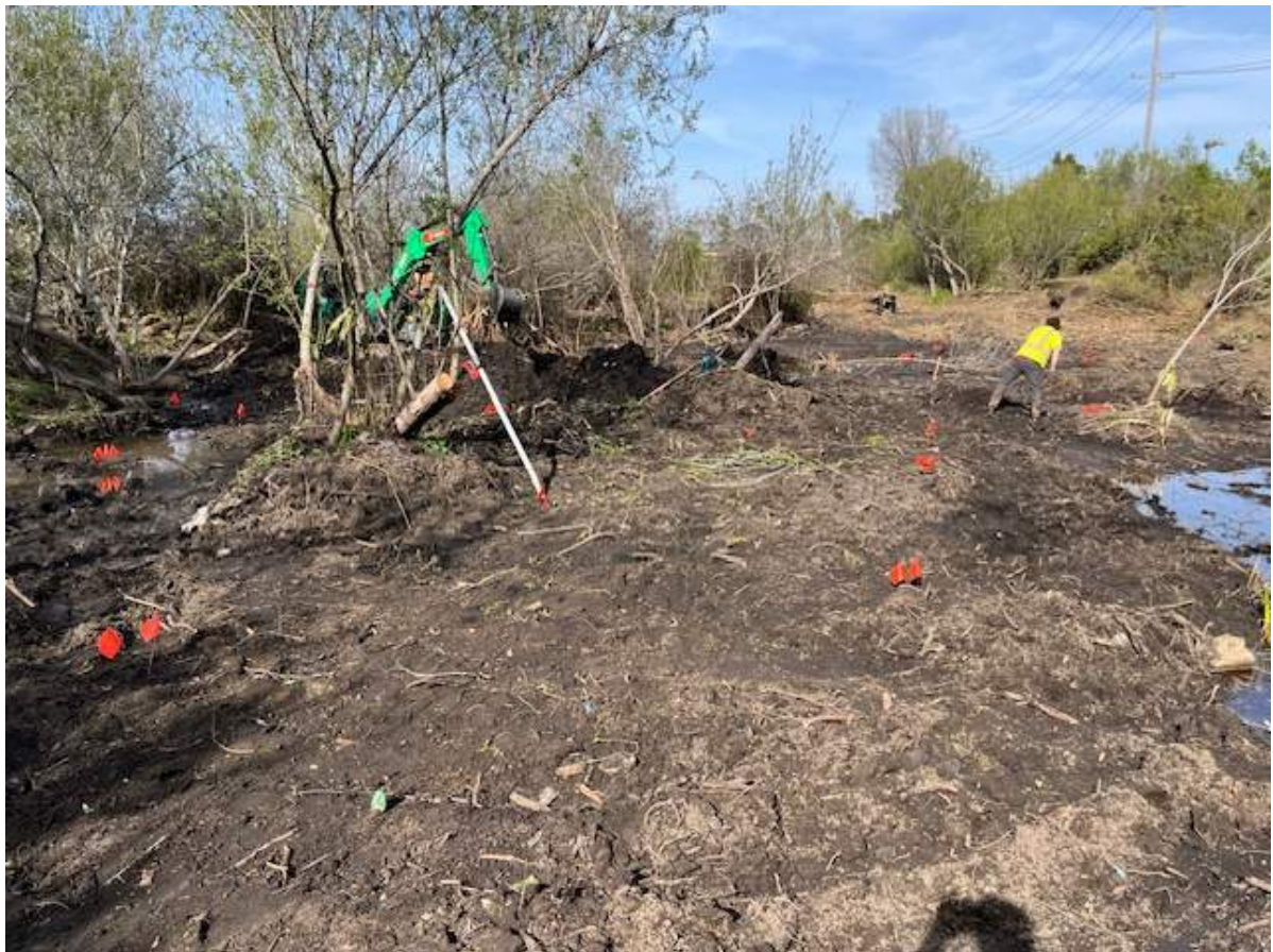
#1 establishing grades