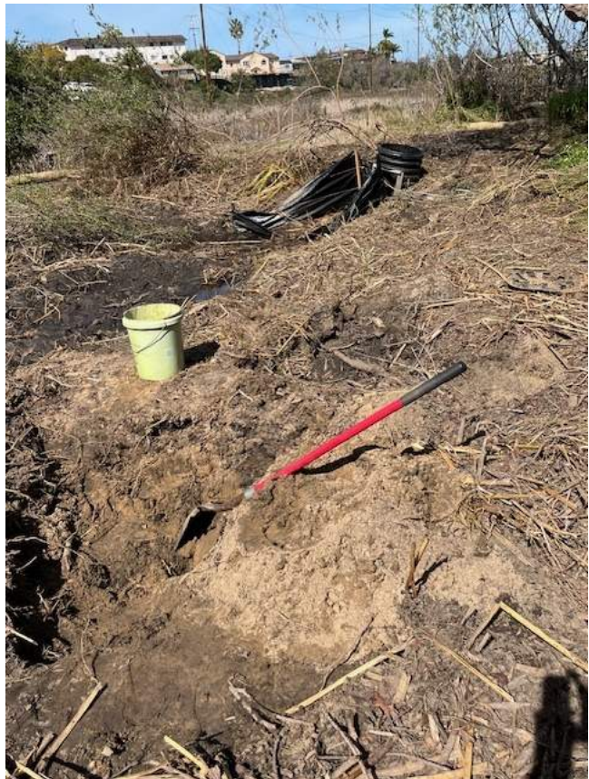
mining sand for trails