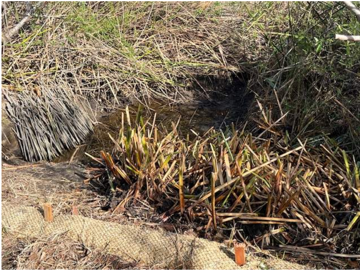
storing bullrush rhizomes