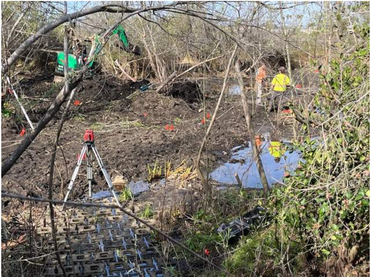
#1 establishing a local positioning system