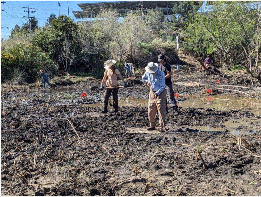
#2 volunteers planting bullrush and fine grading with shovels