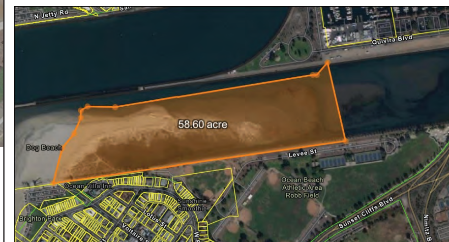
Surrounding parcel (above) and regional area (below)