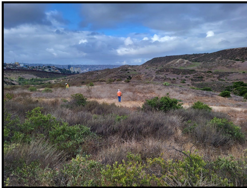
Photo Point 8: 10/23/23 – Looking Southwest. Weed whacking being performed.