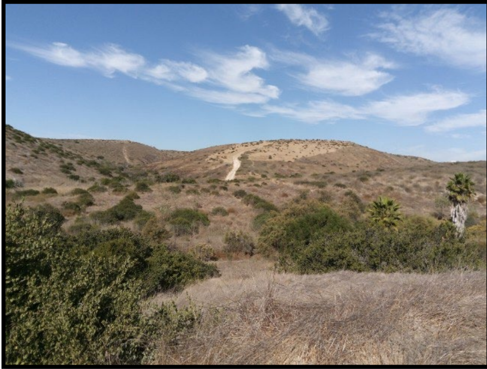
Photo Point 2: 11/14/23 – Looking North. Slope in the background upper portion weed whacked.