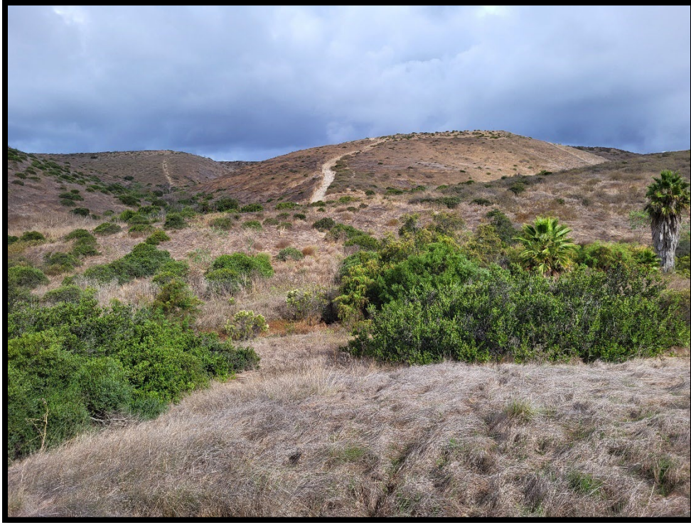
Photo Point 2: 10/23/23 – Looking North. Slope in the background lower portion weed whacked.