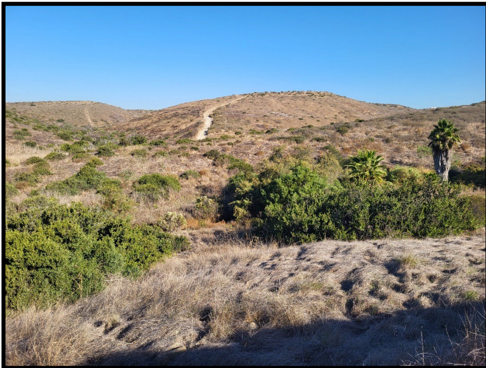
Photo Point 2: 11/3/23 – Looking North. Slope in the background lower portion weed whacked.