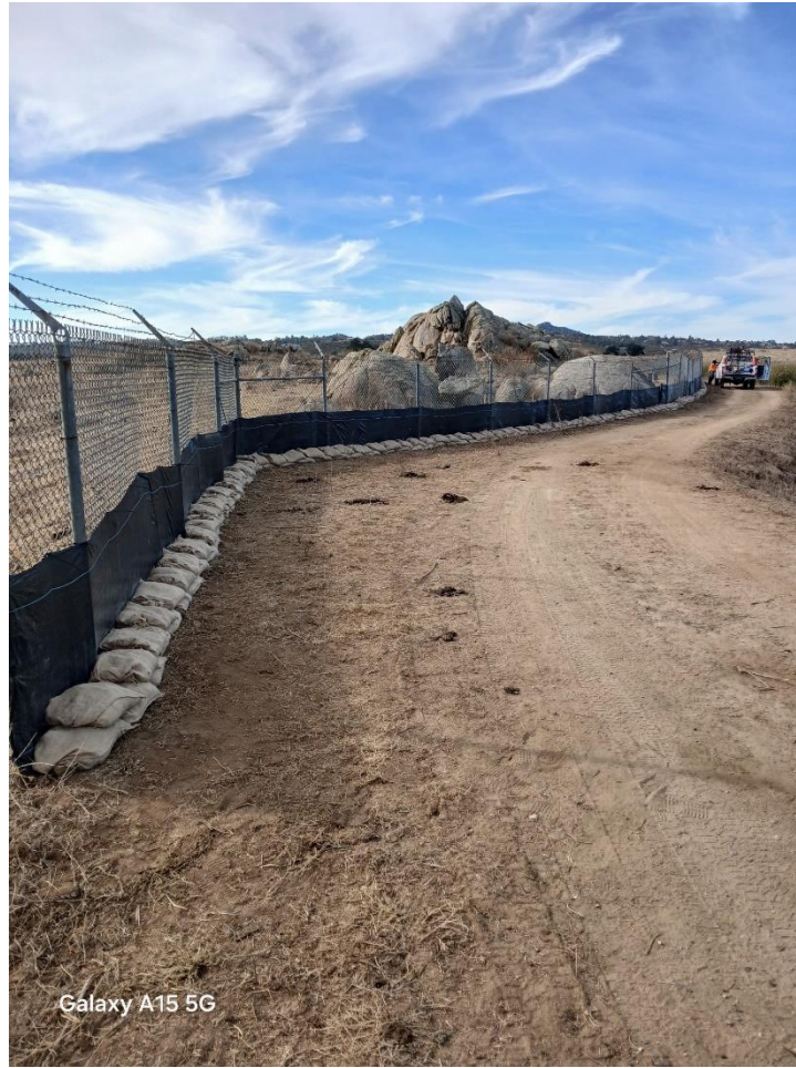
Picture 2: Exclusionary fence installed along fence line at Pond 2 at Ramona Grasslands (Task 1; December 2024).