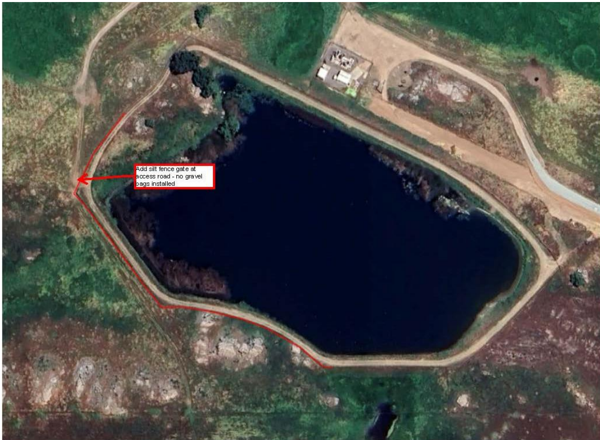
Figure 1: Exclusionary fencing along fence line at Ramona Grasslands Pond 2 (Task 2; December 2024).