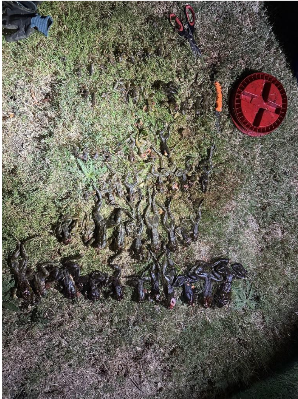
Picture 4: Bullfrogs captured during survey at Boulder Oaks (Task 2; October 2024).