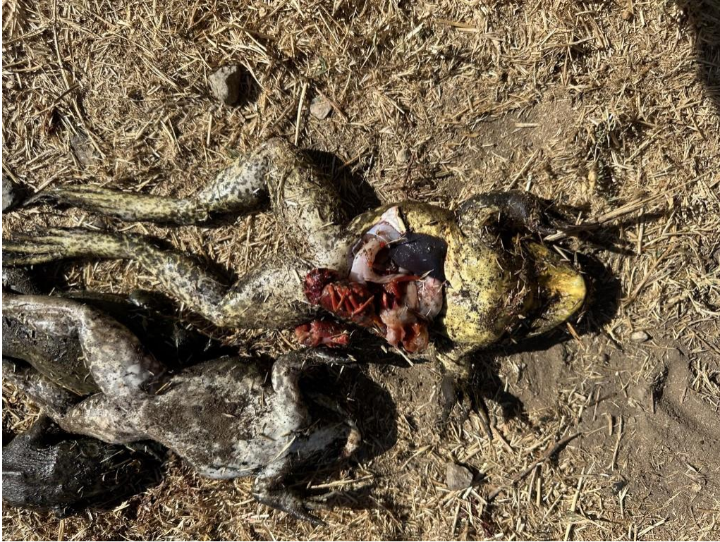
Picture 1: Stomach contents observed in bullfrog captured at Ramona Grasslands (Task 1; October 2024).