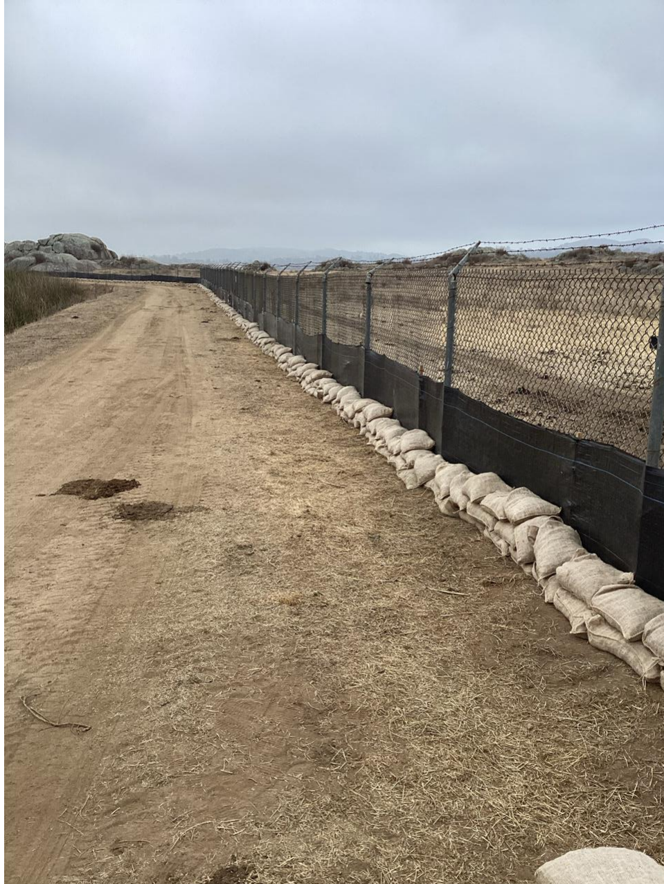
Picture 3: Exclusionary fence installed along fence line at Pond 2 at Ramona Grasslands (Task 1; December 2024).