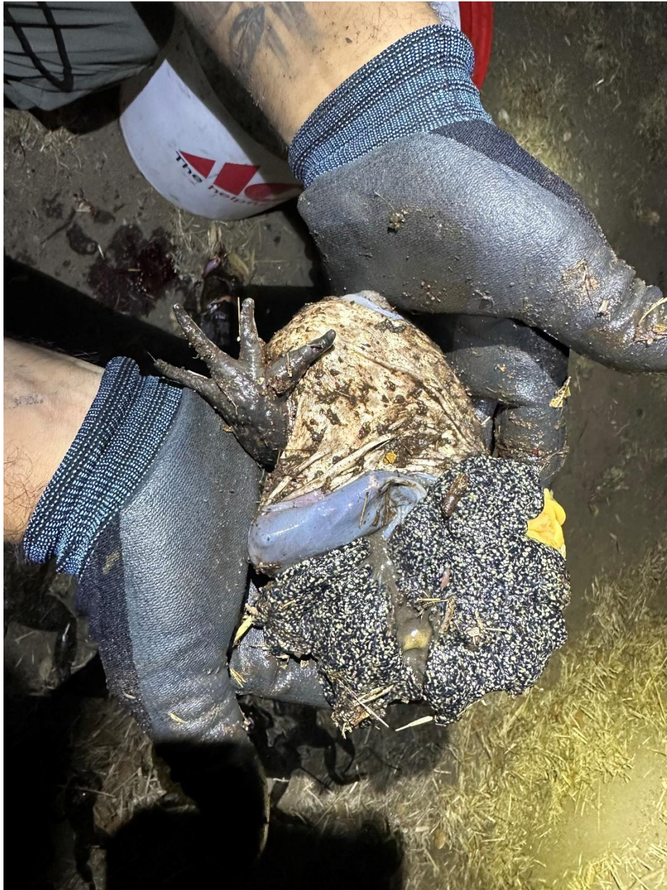
Picture 2: Adult bullfrog with egg mass captured at Boulder Oaks Preserve (Task 1; September 2024).