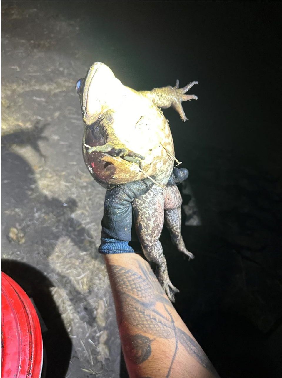
Picture 1: Female ready to spawn captured at Boulder Oaks Preserve (Task 1; September 2024).

Photographs and figures are invaluable! Please include photos in the Quarterly Progress Reports and any figures (if applicable). Both photos and figures may be included throughout the document under corresponding tasks or at the end following the Issues to Note section. Photographs taken at the same place or photographic points (photo-points) can assist SANDAG staff in tracking the project's progress over time.