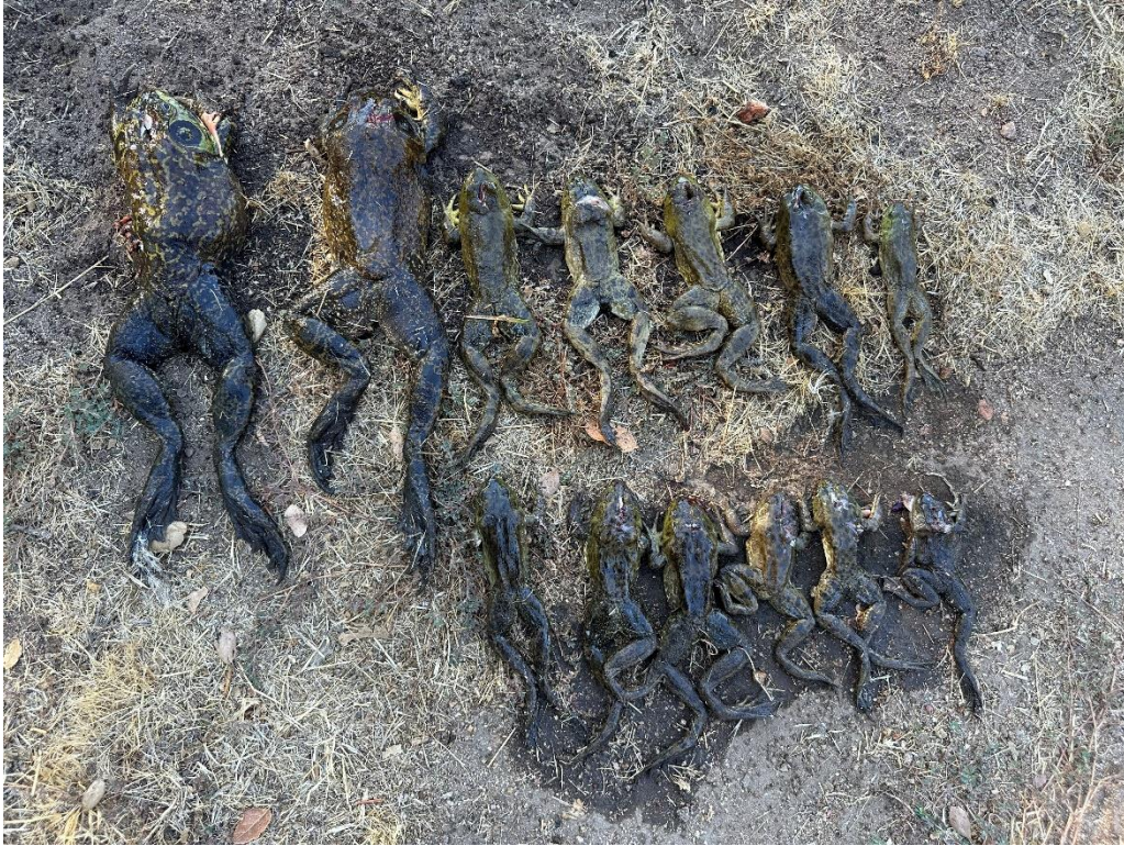
Picture 3: All bullfrogs eradicated from Pond 1 at Boulder Oaks Preserve (Task 1; August 2024).