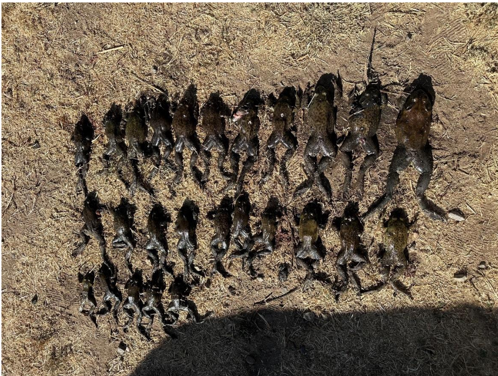
Picture 6: All bullfrogs eradicated at Ramona Grasslands (Task 1/August 2024).