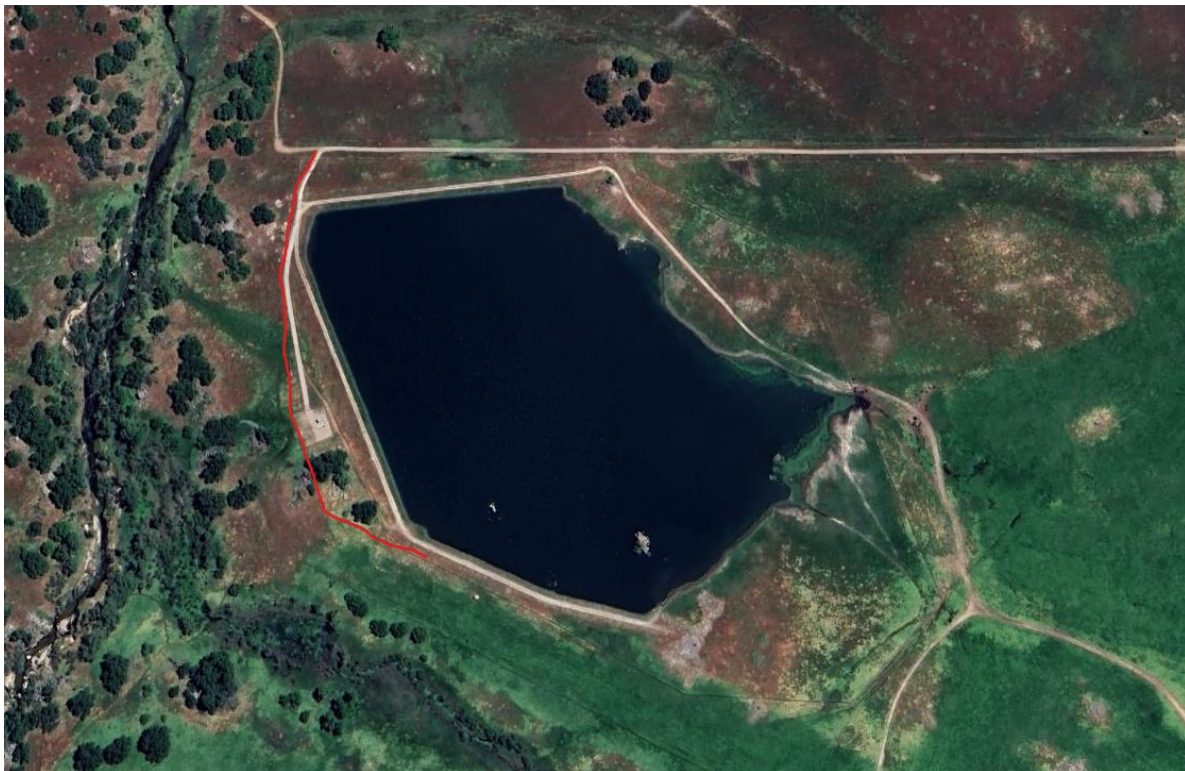
Figure 1. Exclusionary fencing along western fence line at Ramona Grasslands Pond 1.