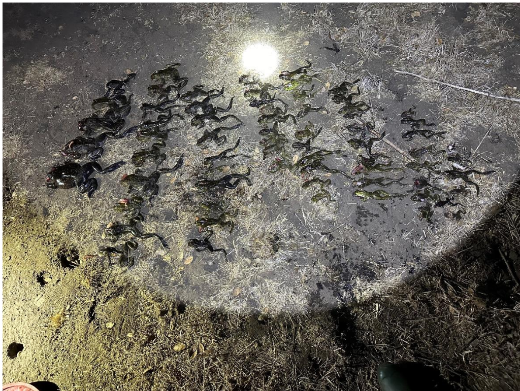
Picture 4: All bullfrogs eradicated from Boulder Oaks Preserve (Task 1; September 2024).