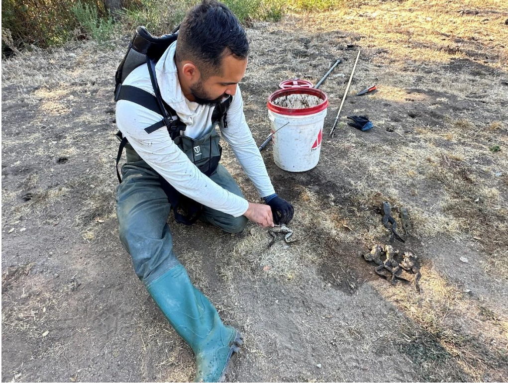
Figure 5: Biologist collecting stomach content information at Boulder Oaks (Task 1; August 2024).