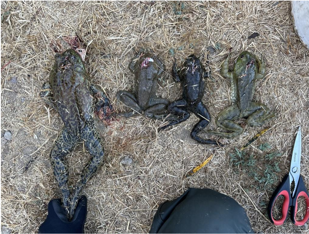
Picture 7: Bullfrogs eradicated from Ramona Grasslands (Task 1/September 2024).