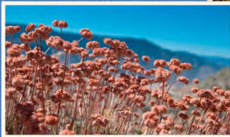
Eriogonum fasciculatum in fruit