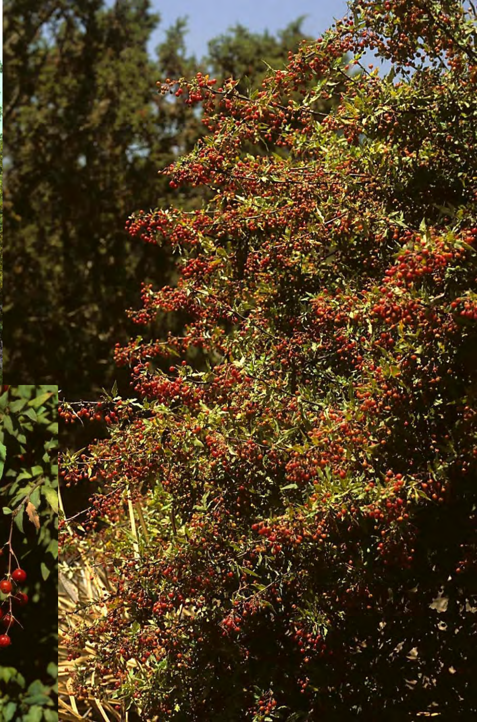
Berberis ( Mahonia ) nevinii