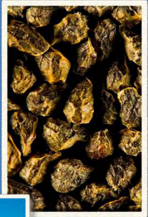
Trichostema austromontanum subsp. compactum seeds