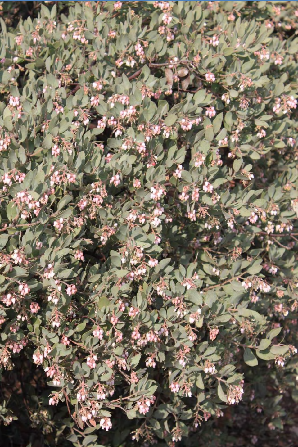
Arctostaphylos glandulosa subsp. crassifolia