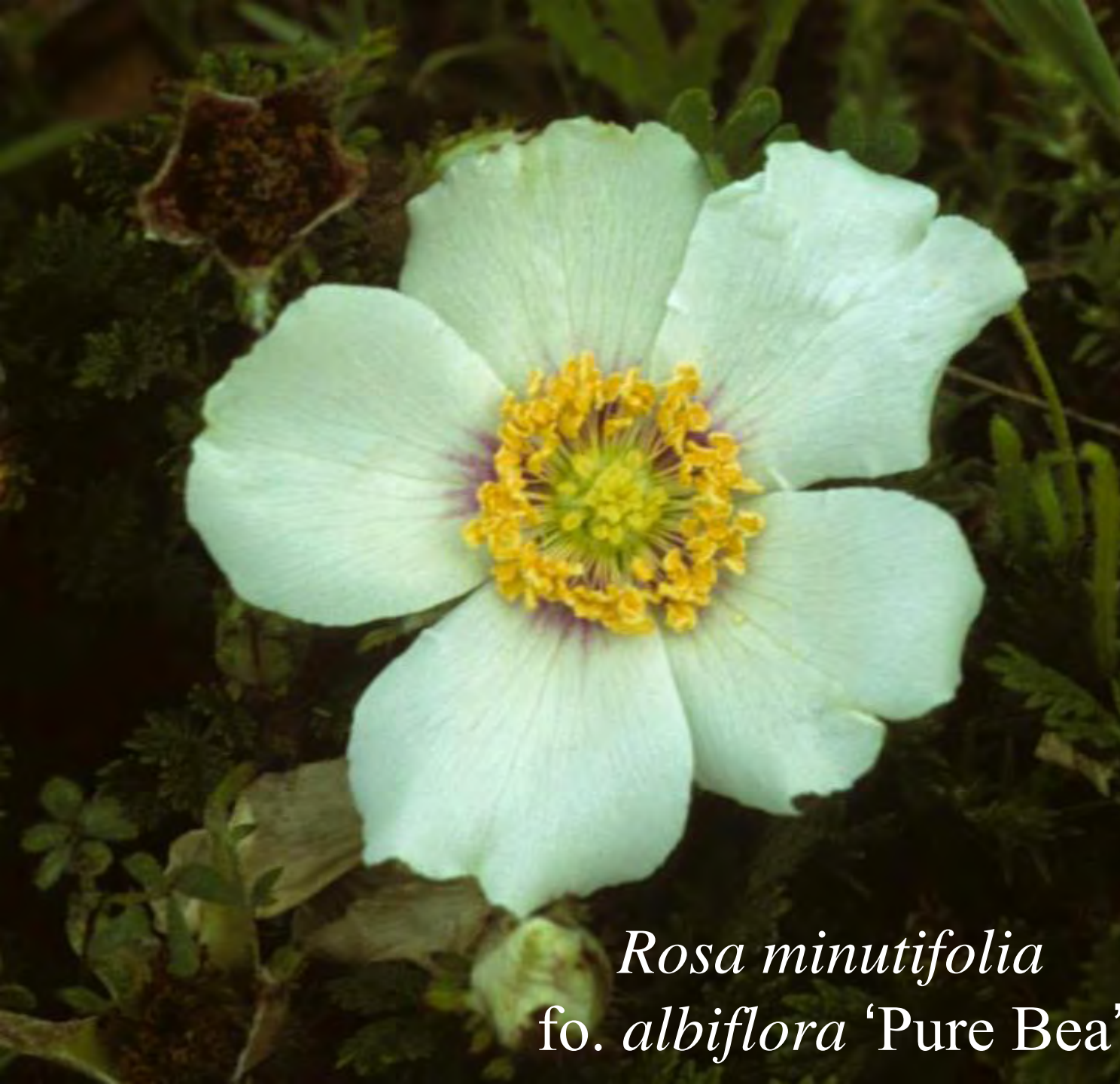
Rosa minutifolia fo. albiflora 'Pure Bea'