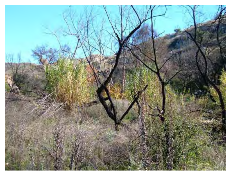
Photo 3. View from creek facing the northern slopes of the Preserve.