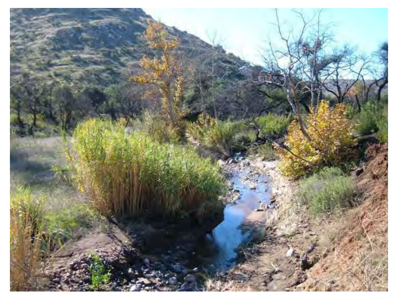
Photo 1. Unvegetated slopes and emerging stands of arundo along the creek.